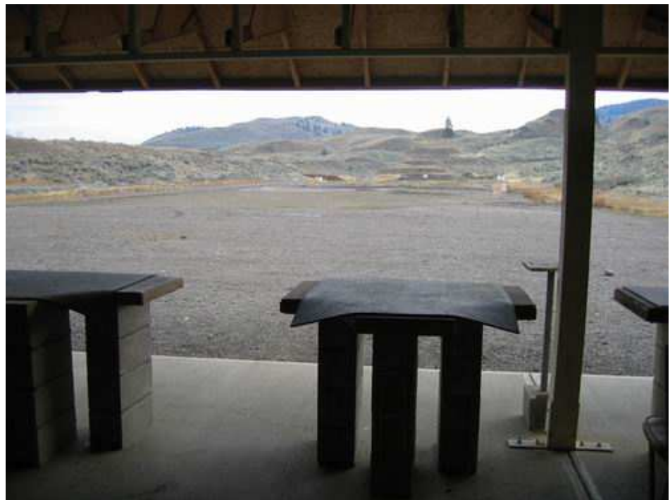
From inside the covered area at the long range.

On a darker side, sometime this winter someone took it upon themselves to do a penetration test through the gussets of our new roof at the Short Range. As one of a handful of members who solicited materials, and supplied tools and labour to complete this project, I wish to CONDEMN this person and their activities. Also, I invite all members to police their activities at YOUR CLUB facilities. REMEMBER THE CLUB IS A REFLECTION OF YOU, MAKE IT A GOOD ONE!